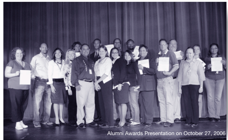
Alumni Awards Presentation on October 27, 2006

To learn more about the Sunset Foundation and its scholarship program, visit its website at www.sunsetfoundation.org .