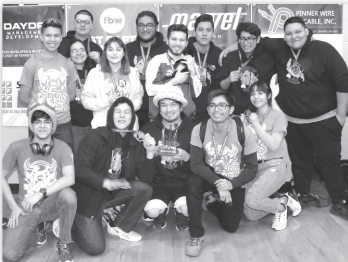
Sunset 2020 Robotics Team