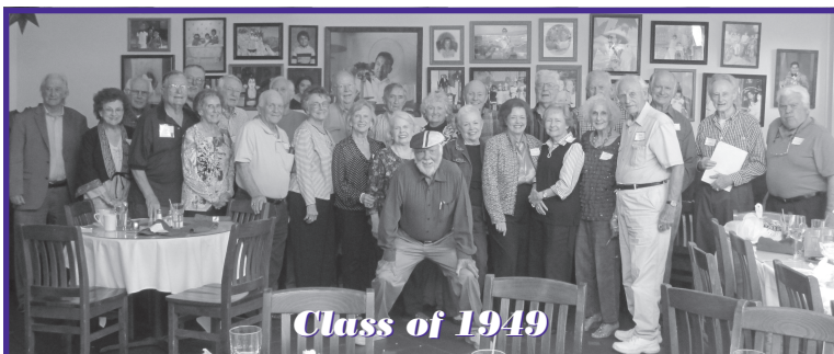
Class of 1949

Class of '49 plus a few spouses gathered for lunch at La Calle Doce in Oak Cliff on November 10. Members came from as far away as Oklahoma City, San Antonio, and Conroe, TX. These are some fine looking Bisons!! Go 49ers!